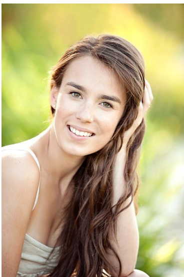
Good size and resolution