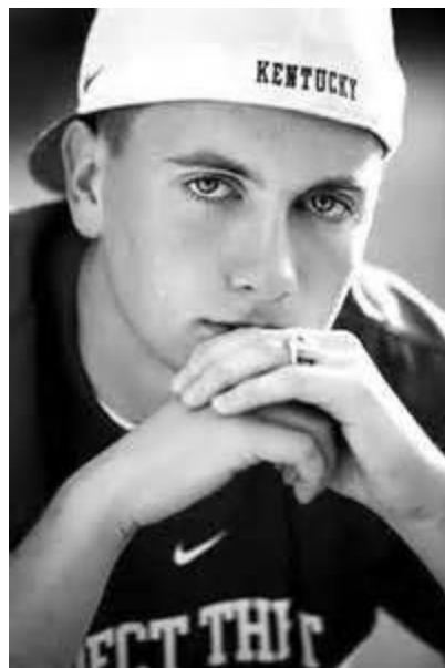
Good size and resolution

If you have further questions, please contact Ethan Stelzer at ethan_stelzer@rpcademy.org