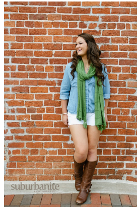
Face too small, will need to be cropped